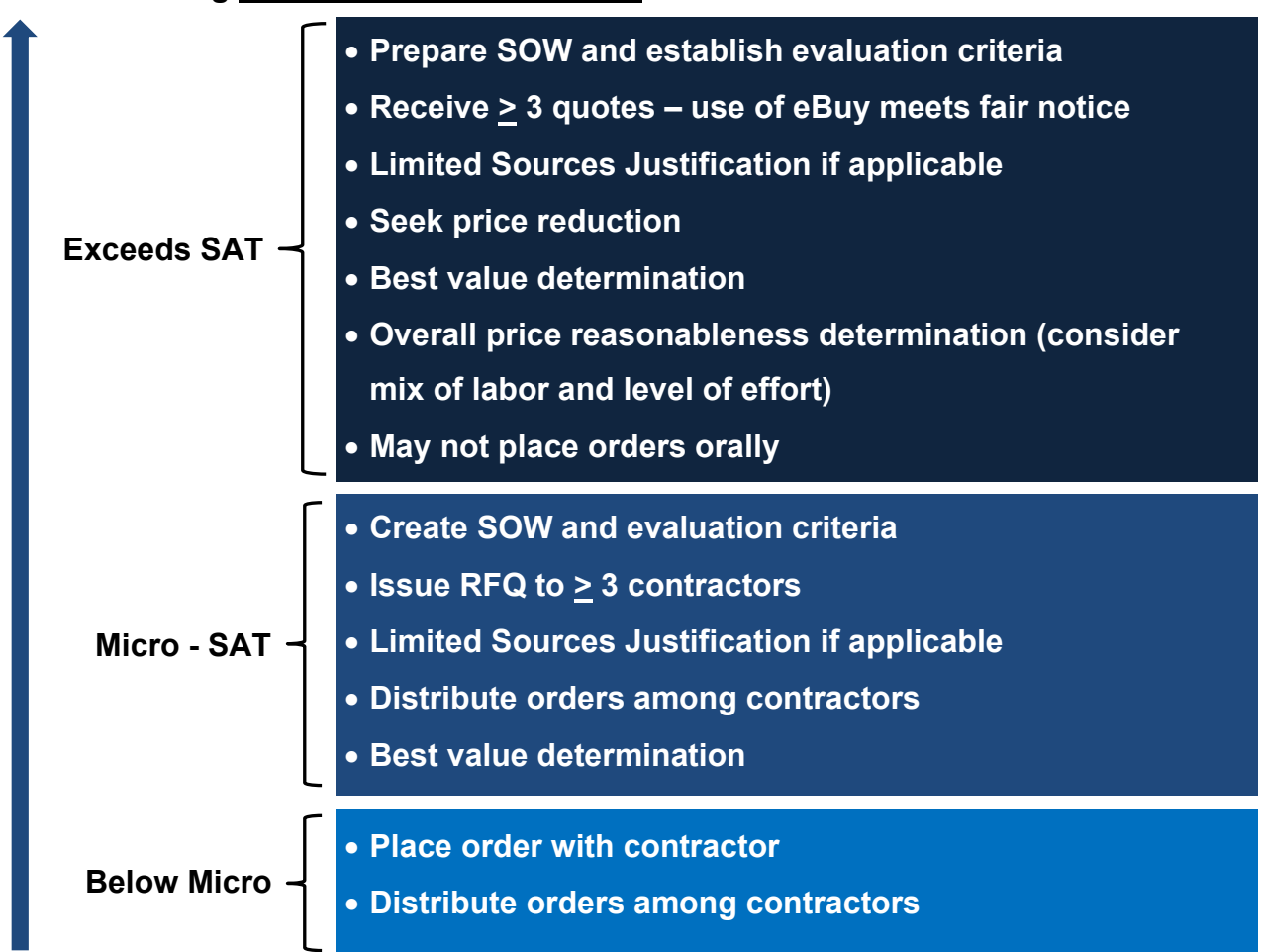
Figure 2: HACS Ordering Process related to the SAT

See also GSA Quick Reference MAS Ordering Guide